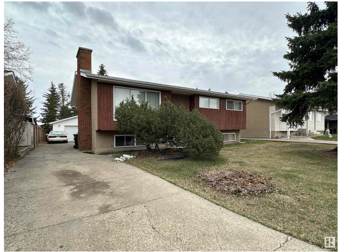
132 Richfield Rd NW, Edmonton, AB

This property could be a great purchase for the right buyer. Although it requires updating, as it is mostly in original condition, yet is located on large, 7,148 sq.ft ( 664.06 sq.m.) lot backing walking path with steps to Bhullar Park. Fantastic, double detached, oversized (23.3' by 23.3' interior) garage was built with permit in 2002. Main floor offers living room with wood burning fire place, kitchen, 3 bedrooms and 1 and a half baths. Basement is fully developed and has large windows. Located close to schools, transportation and good proximity to Whitemud Drive and Anthony Henday highway. Property is being sold in "as-is" condition. Make a move and build some sweat equity!