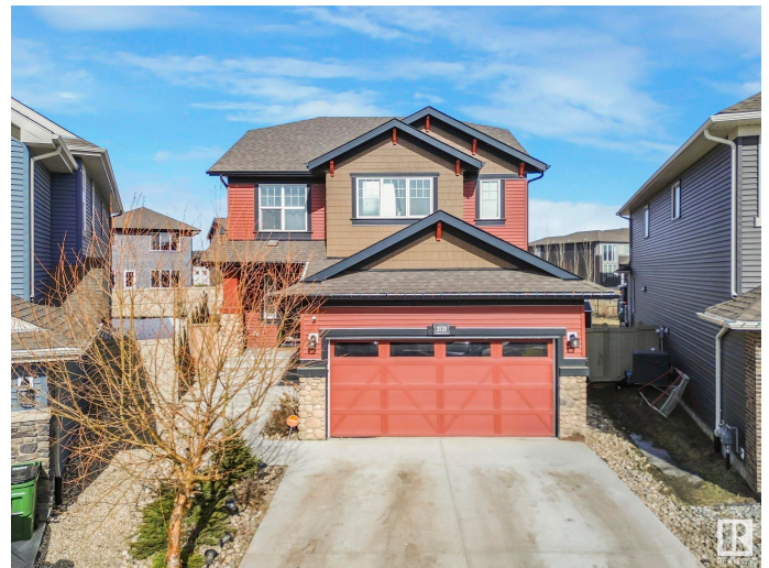
2539 Orchards Way SW, Edmonton, AB

MLS® # E4427515 Price $850,000 Bedrooms 6