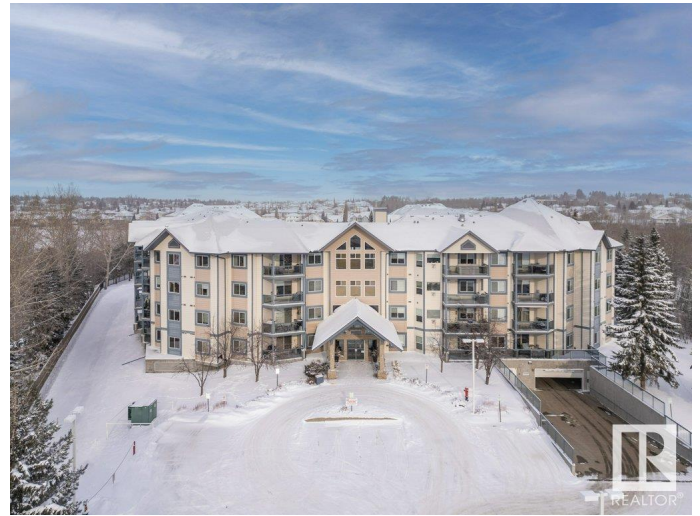
414-100 Foxhaven Dr, Sherwood Park, AB